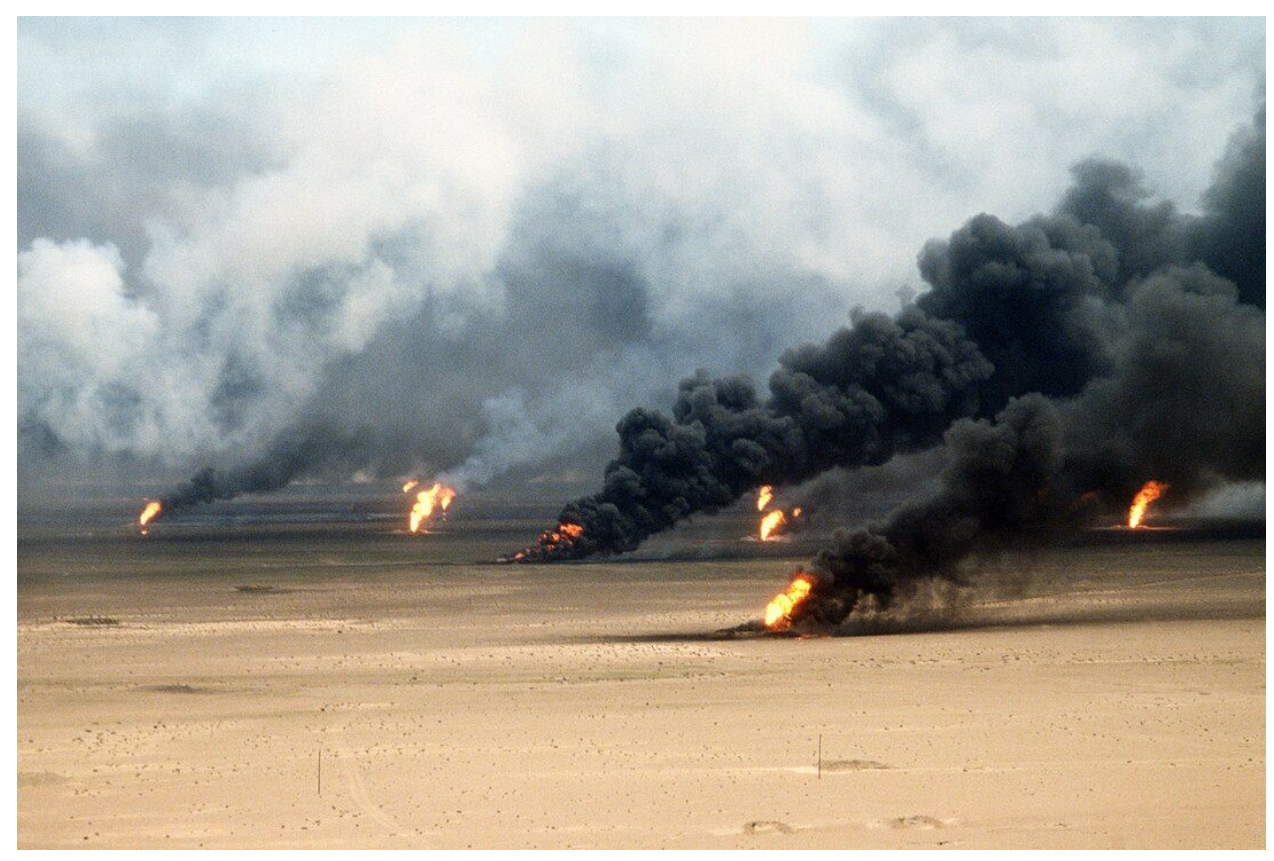
Oil well fires rage outside Kuwait City in the aftermath of Operation Desert Storm.

The direct impacts of terrorism on the environment are abrupt and disastrous. The use of explosive materials in rural areas generates significant damage to the environment. Acts of terrorism destroy the ecosystem and are often the cause of defoliation. The disposal of military equipment and the destruction of natural resources, such as oil fields, are also the result of terrorist activity.