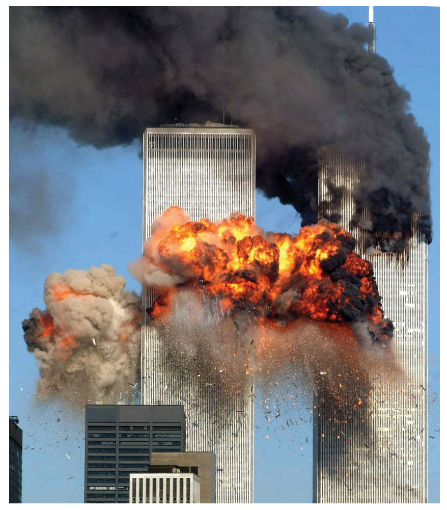
September 11 attacks, United States, 2001

It's speculated that al-Qaeda terrorists used the Internet to plan their operations that were carried out on September 11, 2001. Confiscated computers from Afghanistan were reported to reveal that al-Qaeda was compiling data about targeted individuals and exchanging encrypted messages via the Internet. Al-Qaeda members operating in the United States have reportedly been using Internet-based phone services to communicate with members overseas since September 16th, 2002. For this reason, it's inferred that the Internet is being used as a tool to facilitate the planning of acts of terrorism: it provides anonymity, control resources and other measures that facilitate coordination and integration of attack options.