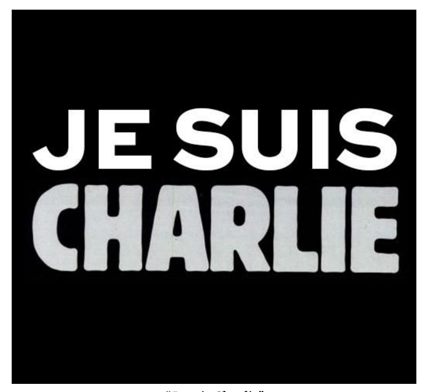
"Je suis Charlie"

In the morning of January 8, Coulibaly killed policewoman Clarissa Jean-Philippe and injured a man in Southern Parisian suburbs. On January 9, Coulibaly entered a supermarket in the city of Paris and took the owner hostage to demand that the police release the Kouachi brothers from where they were besieged. After the Kouachis' deaths, special forces entered the supermarket, shooting Coulibaly and freeing 15 hostages. Four of the hostages were found to have been killed by Coulibaly.