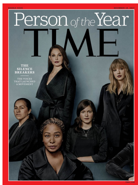
Cover of Time magazine, 2017, Person of the year "The Silence Breakers"

Women make up half of the world's population, half of the world's potential. It is necessary to reduce the inequalities that prevent them from developing their capacities to the maximum, to try to exploit this potential and thus promote our development as a society.